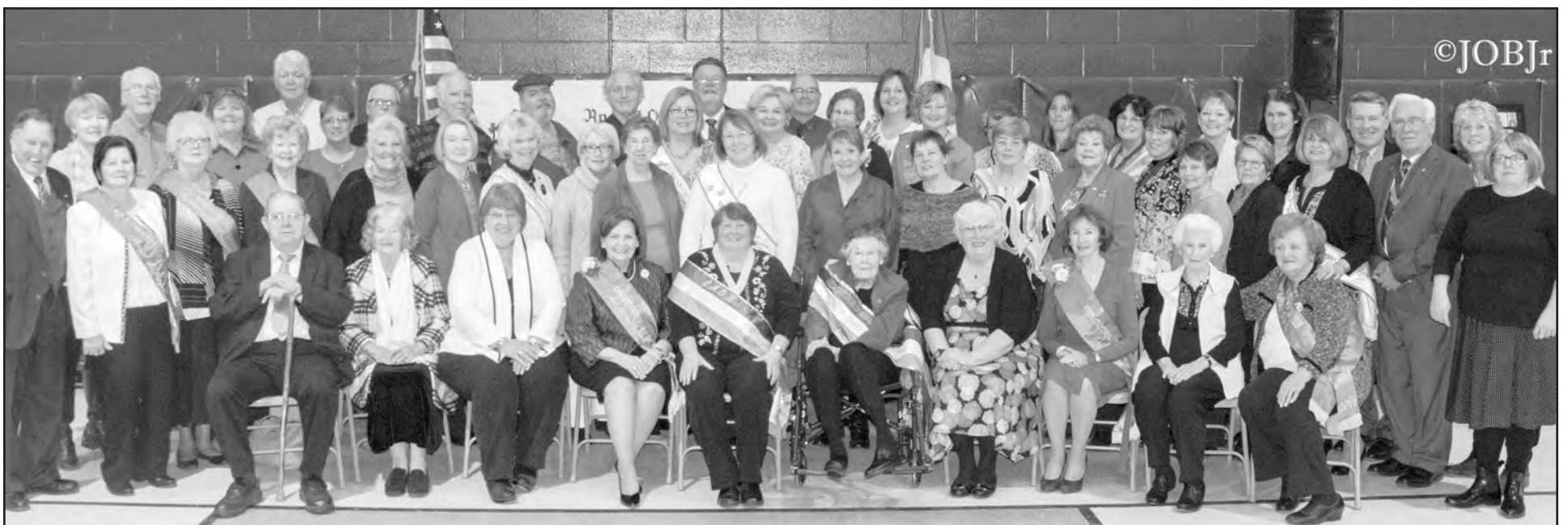
AOH and LAOH members at the St. Brigid's Day Celebration, Cleveland, Ohio