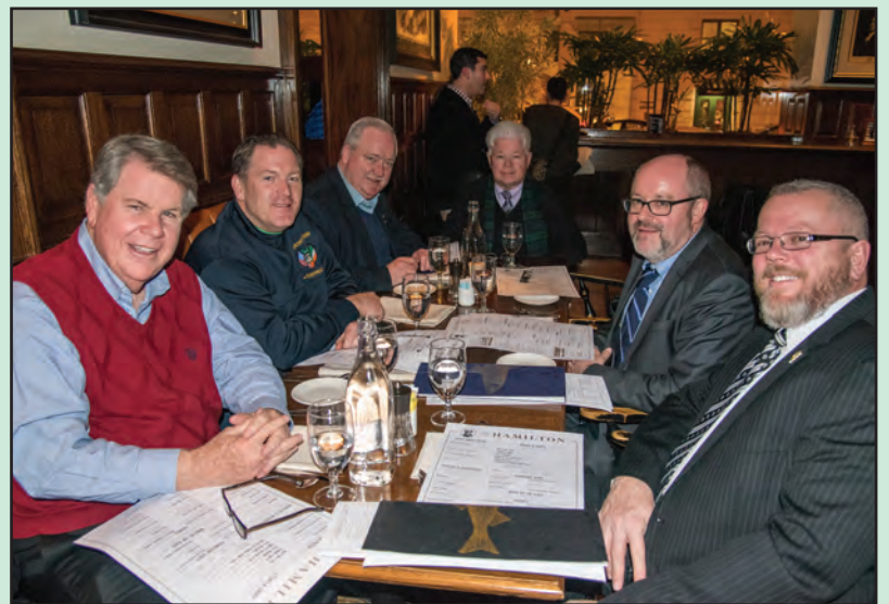
The National Board met with a representative of the Irish Embassy while the board was in town for the March.