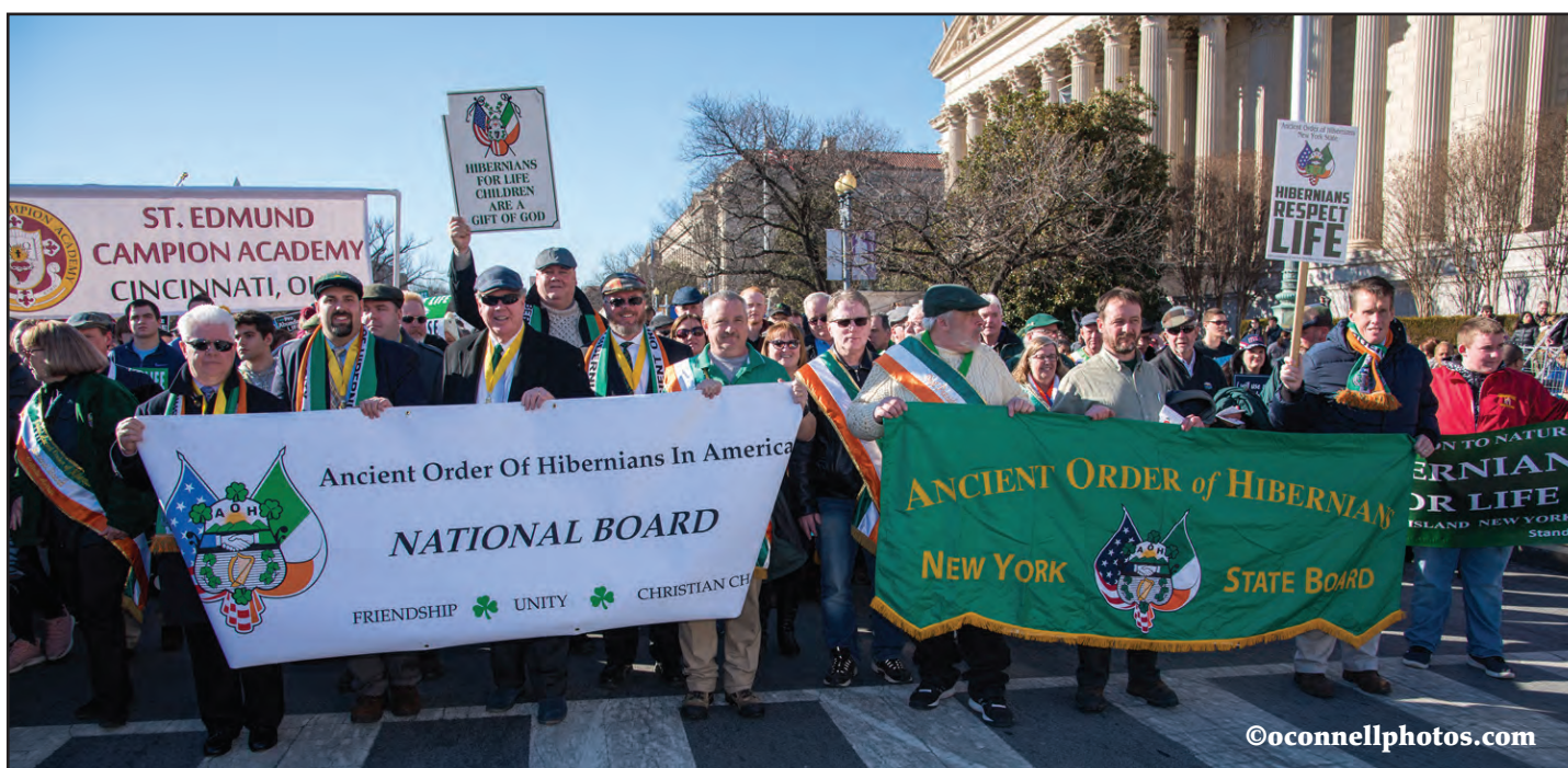
Members of the AOH National Board, the New York State Board, and Hibernians from New Jersey, Pennsylvania, Maryland, Virginia, D.C. and beyond gathered in Washington, D.C. for the annual March For Life on Jan. 19.