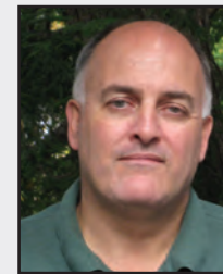
A Message from Ray O'Hanlon Page 9