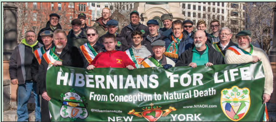
New York Hibernians pose at the rendezvous point, the memorial to the Grand Army of the Republic.